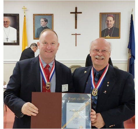
December SK of the Month