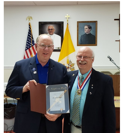
March SK of the Month