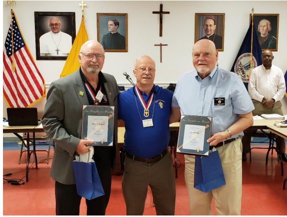
August co-SKs of the Month