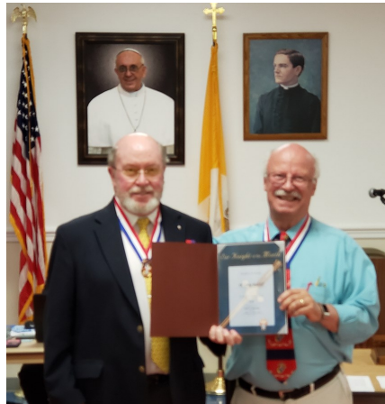
May SK of the Month