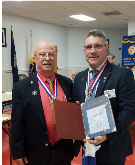
November SK of the Month