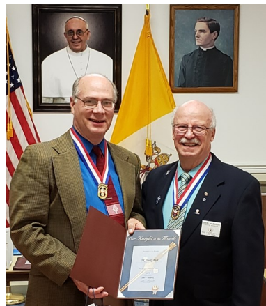
February SK of the Month