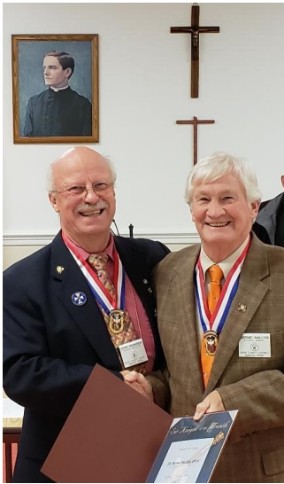
October SK of the Month