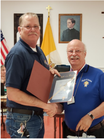
July SK of the Month