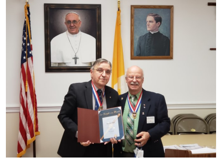
September SK of the Month