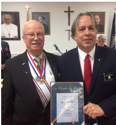
January SK of the Month