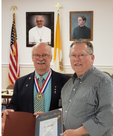
April SK of the Month